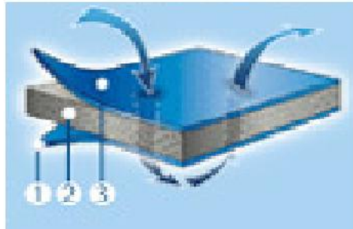
Fig 2. Three-layer structure of neoprene: 1 - the inner layer (in contact with the skin) - 100% cotton or nylon, 2 - middle layer - micro porous rubber, 3 - outer layer - nylon textile

The principle of operation of any mechanical respirator is cutting off the dust and applying an electrostatic charge, which helps to trap small particles.