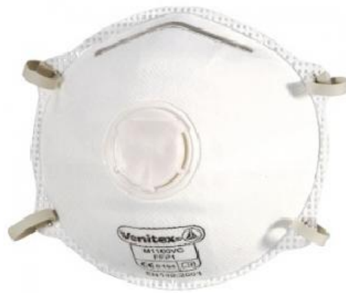
Fig 3. Respirator with exhalation valve

There are also plastic mask. The basis of such masks is statistically charged fibers. Plastic mask can be washed and worn for years. But there are also some disadvantages. Leaking mask fit to face leads to a distinct feeling of smoke as well as the fact that the skin on the face is drawn into the mask, and within 10 minutes there is a trace. [4]